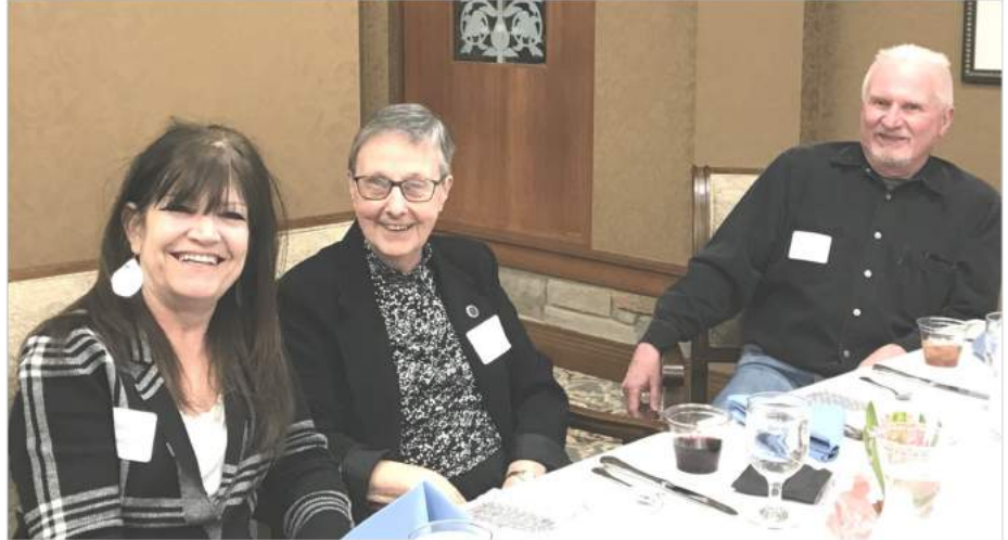
The Sisters hosted their traditional celebration with employees and non-resident volunteers. Here are some happy memories from February 18th: