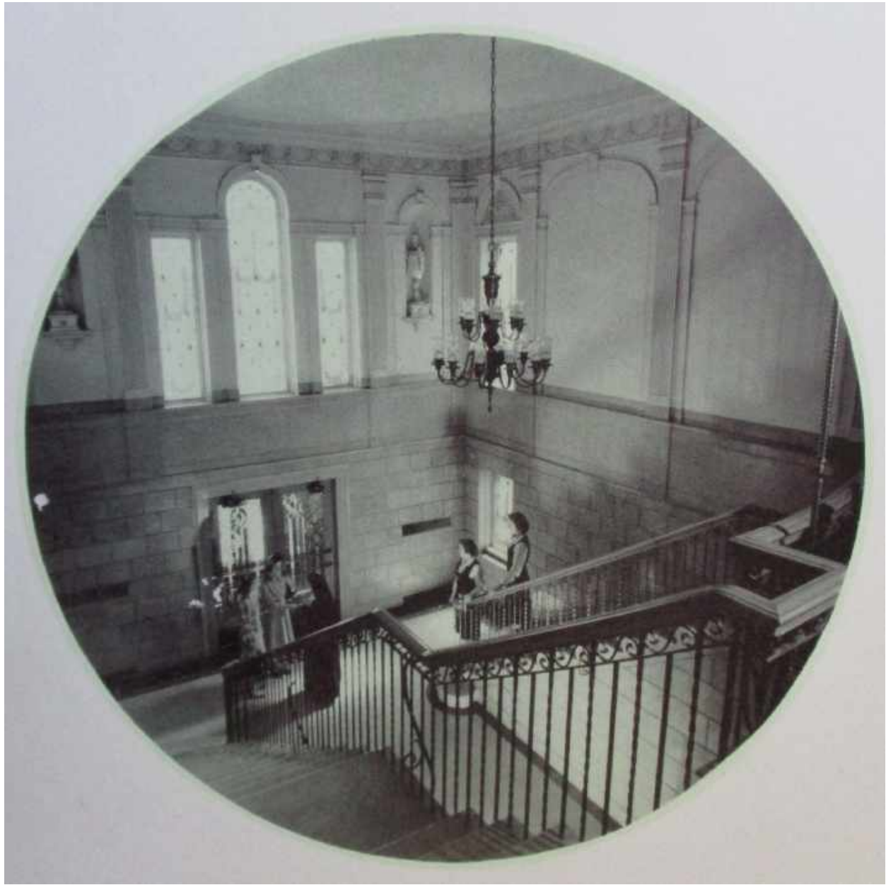
Welcoming you to Sacred Heart's Halls