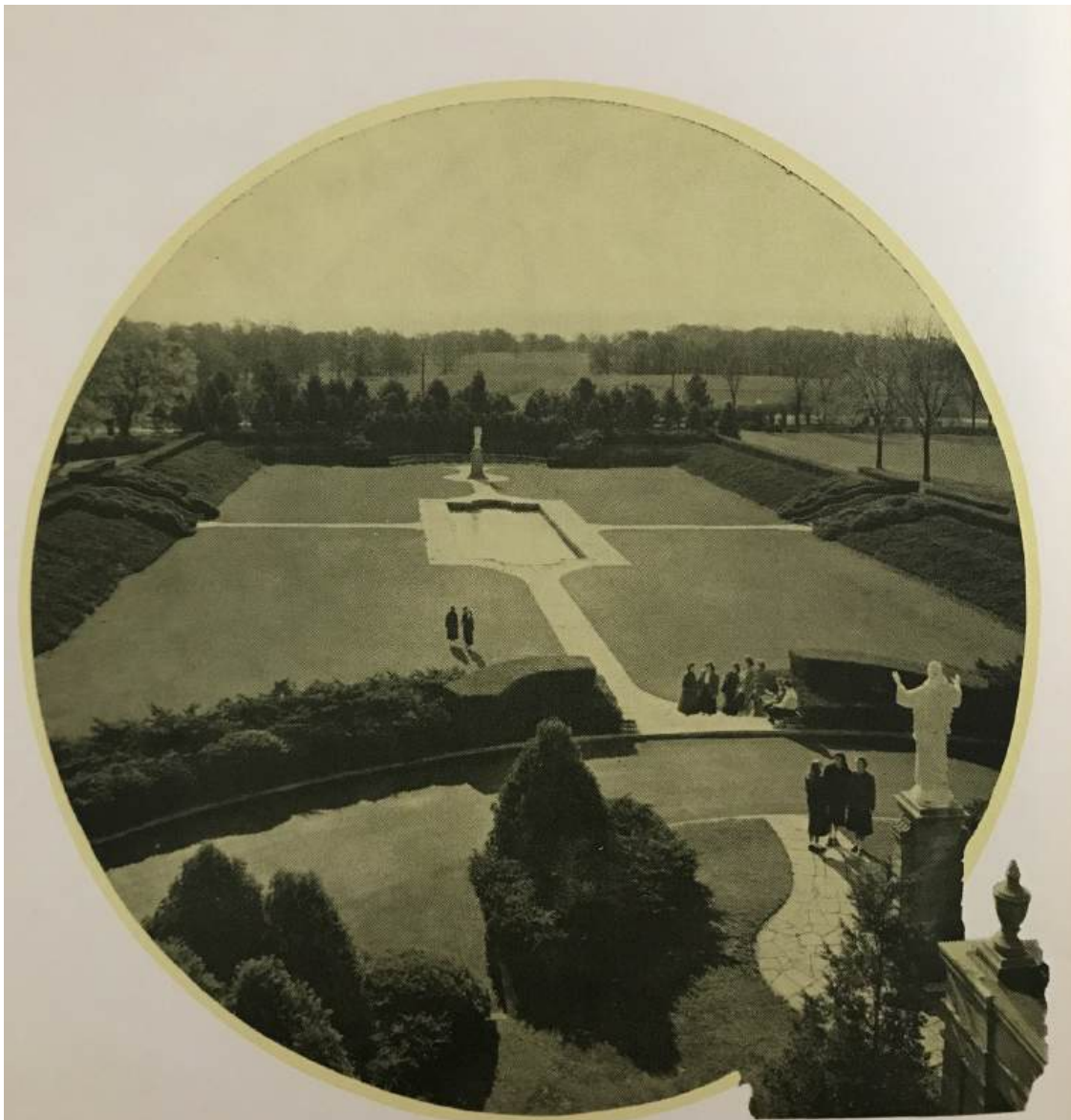
The Stately Beauty of Sacred Heart's Conifer-Lined Sunken Gardens