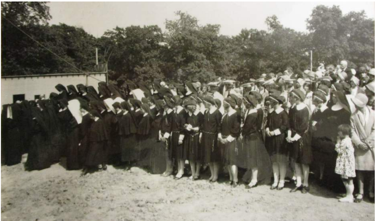
Blessing of cornerstone — June 9, 1929

farmland in the Lisle area opened up for sale to developers, families with high school age children moved in and wanted to have a Catholic day high school. Gradually, Sacred Heart Academy enrolled both boarders and day students. In 1967 the Sacred Heart Academy girls were incorporated into St. Procopius Academy, which had been a boarding school and day school for boys. The school then became a day school for both boys and girls, adopting the new name of Benet Academy.