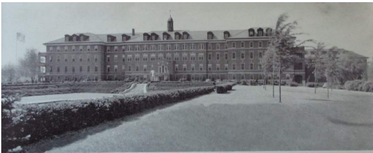
Sacred Heart Academy, Lisle, Illinois