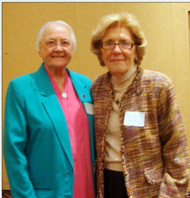
From the Class of 1943 - 70 Years