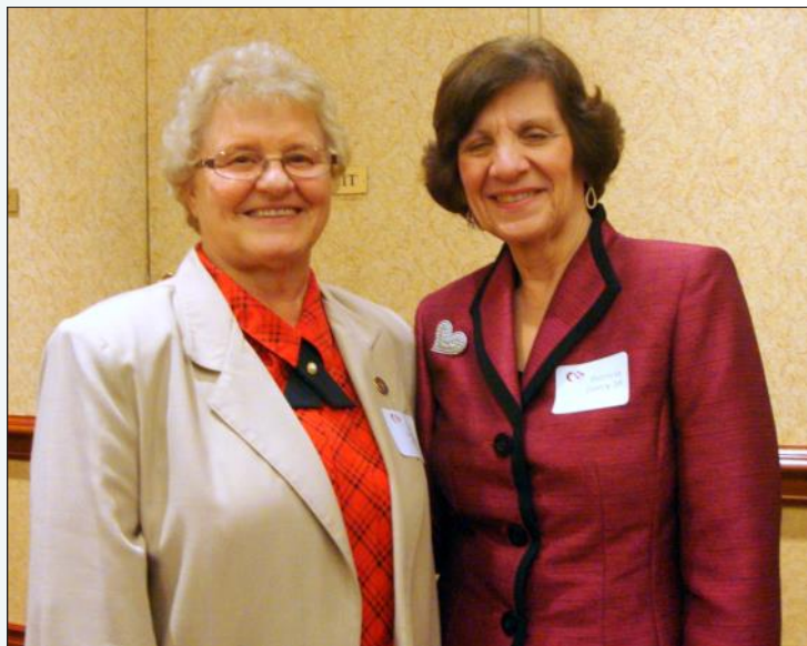
From the Class of 1958 - 55 Years