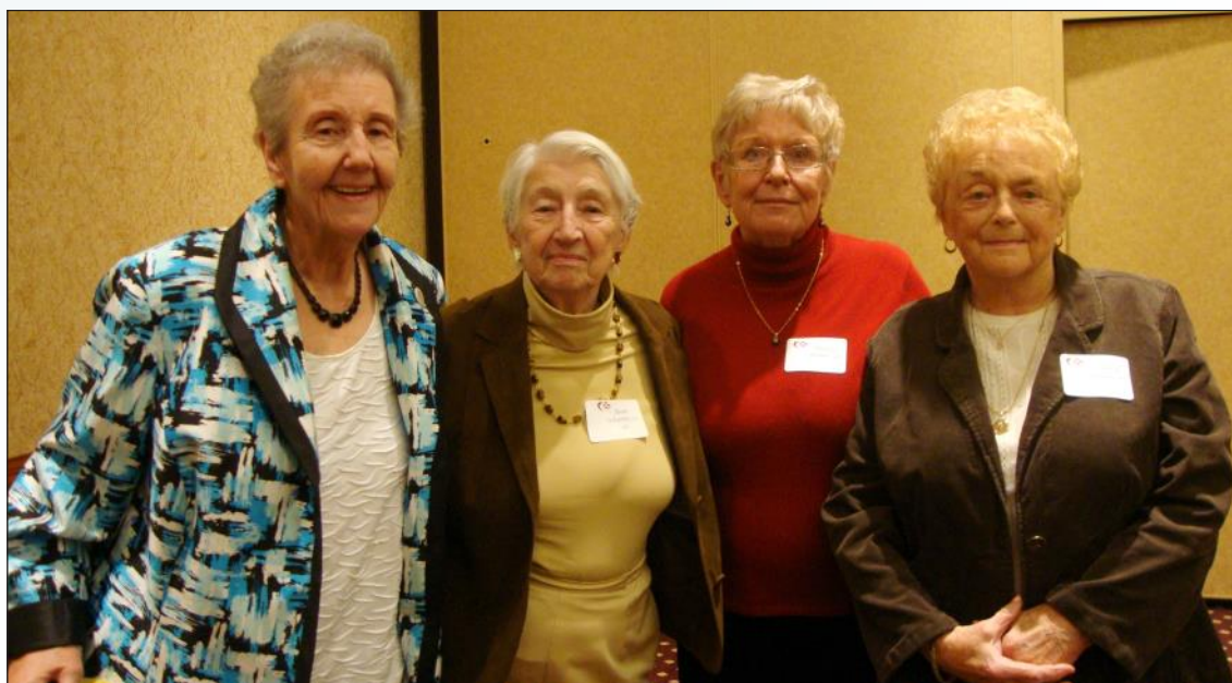
From the Class of 1948 - 65 Years